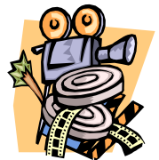
Video & SMPTE Time Code Gen/Rcvr