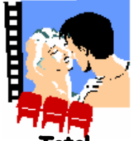
Total Show Control