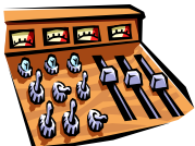
Digital Audio Playback & Control