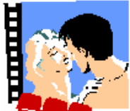
Total Show Control