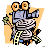
Video & SMPTE Time Code Gen/Rcvr