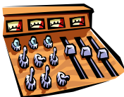
Digital Audio Playback & Control