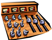
Digital Audio Playback & Control