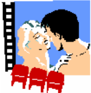
Total Show Control