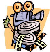
Video & SMPTE Time Code Gen/Rcvr